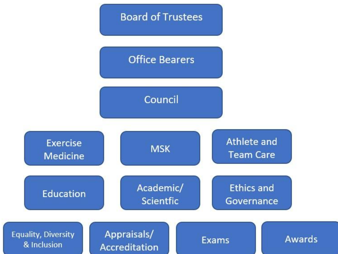
Figure 4. Proposed governance structure

Committees will report to the council who will report to office bearers. The office bearers will report to the board of trustees as per figure 4 below.